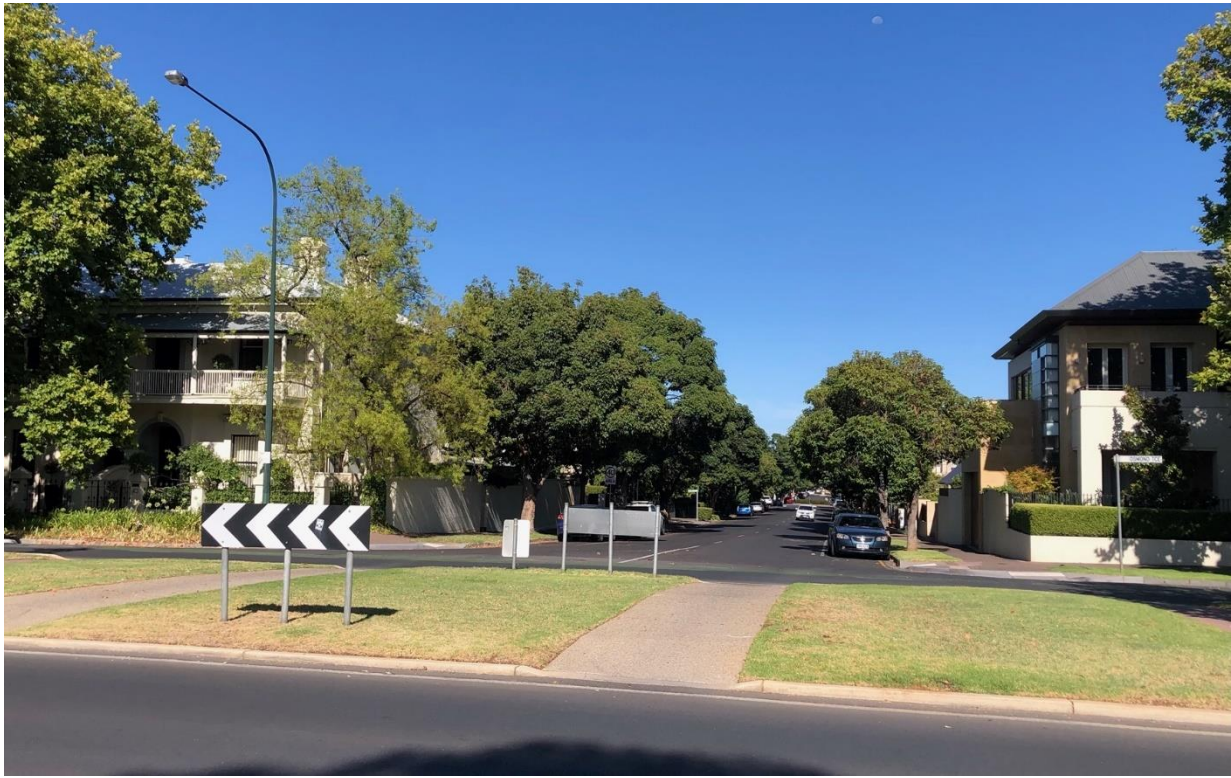
Figure 4: Osmond Terrace roadway median at the junction of William Street, Norwood, looking west