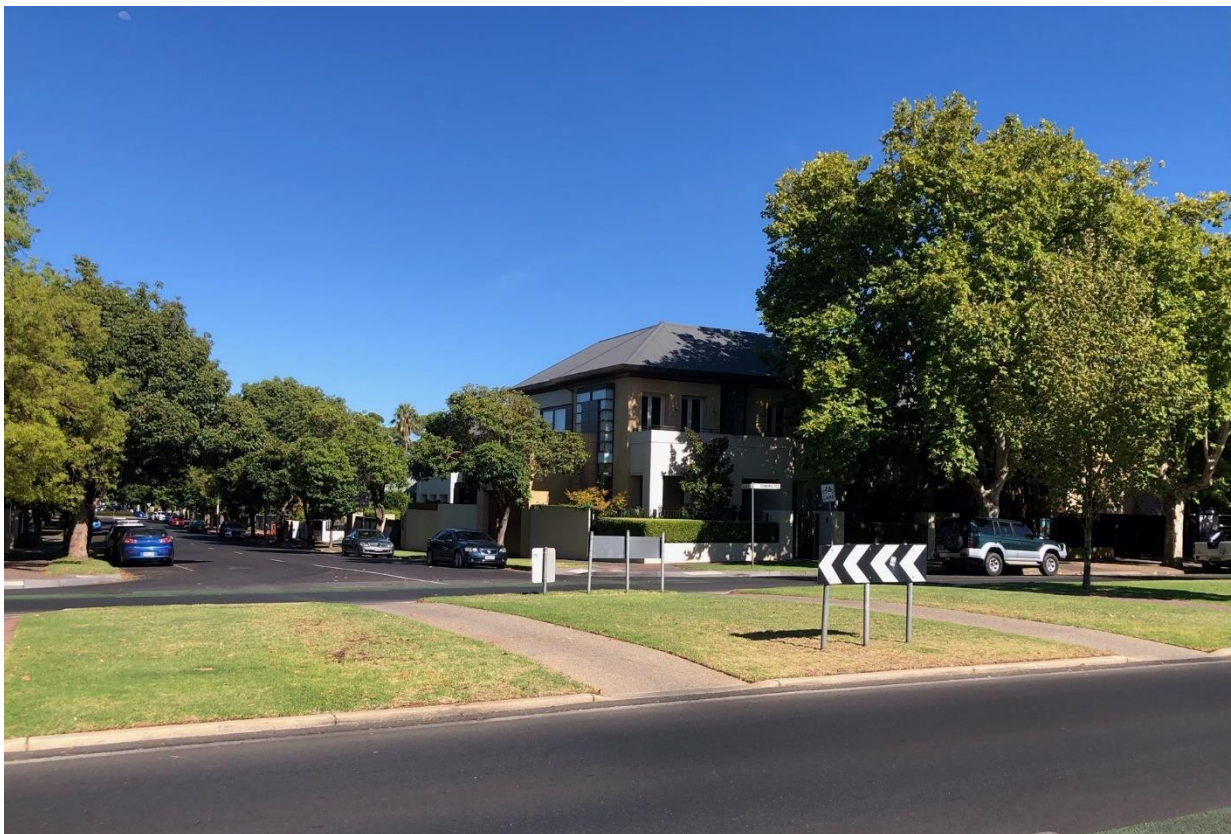
Figure 5: Osmond Terrace roadway median at the junction of William Street, Norwood, looking east