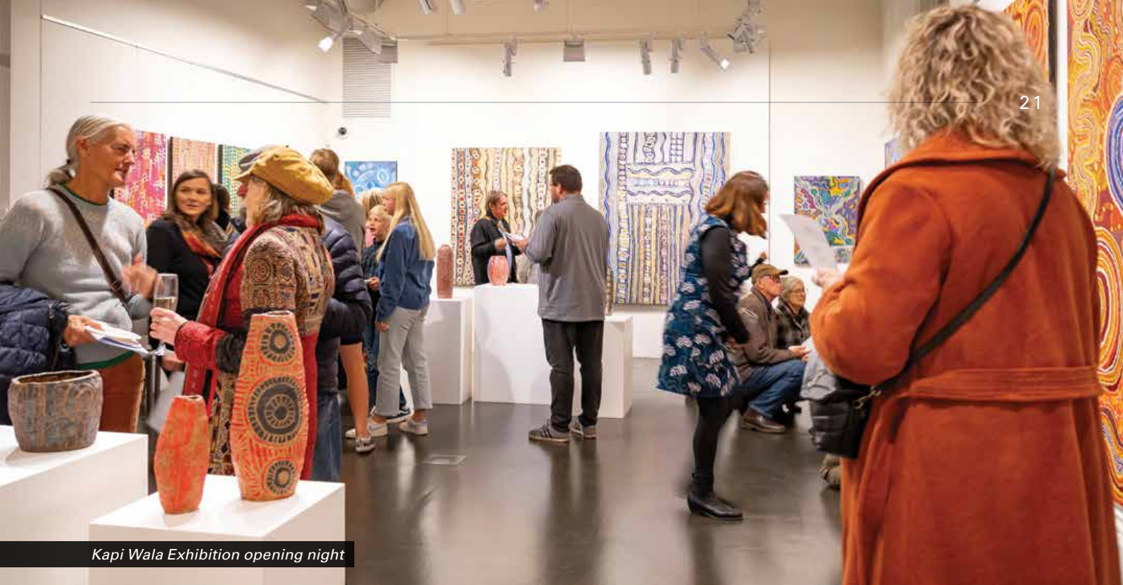
Kapi Wala Exhibition opening night