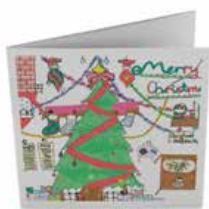
Year 5 Cynthia Norwood Primary School