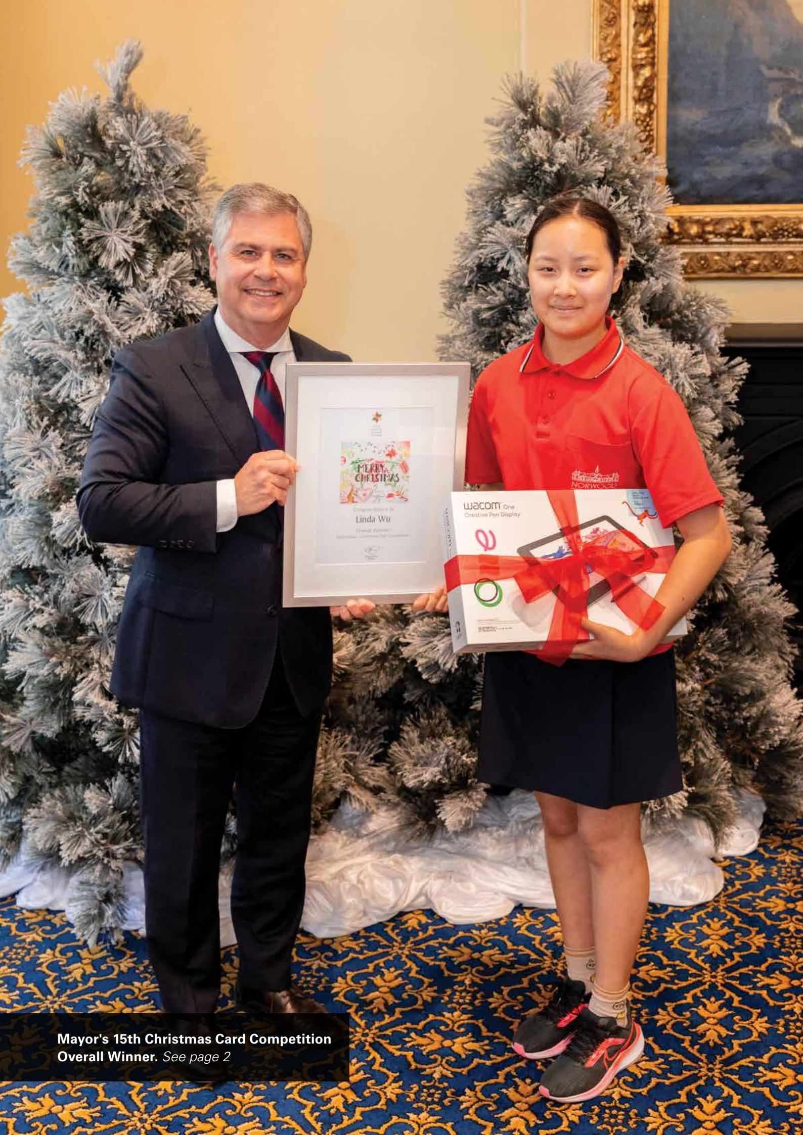
Mayor's 15th Christmas Card Competition Overall Winner. See page 2