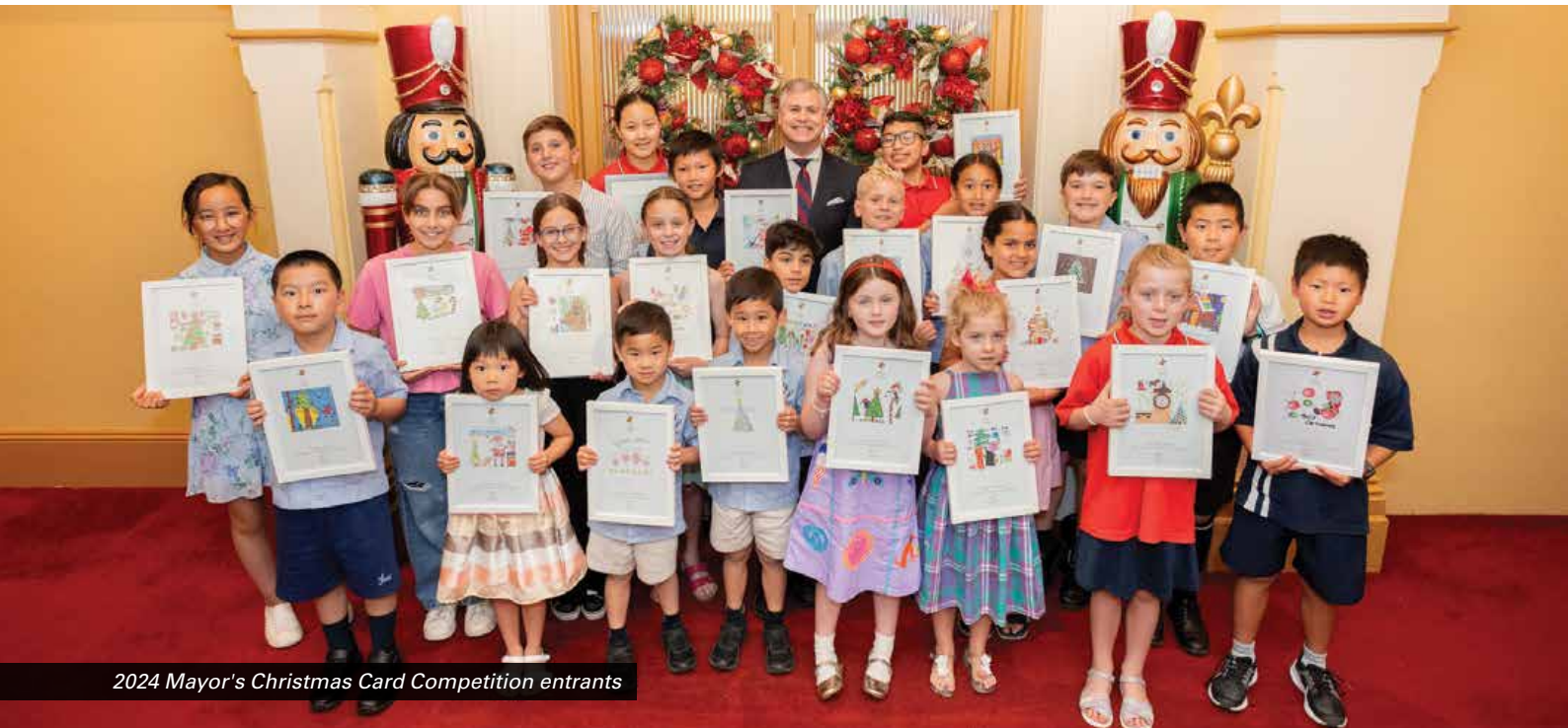
2024 Mayor's Christmas Card Competition entrants