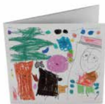
Preschool Madeleine Margaret Ives Preschool