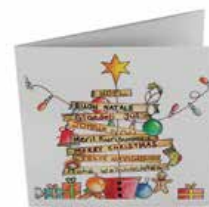
Year 2 Isla Norwood Primary School