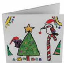
Reception Della Norwood Primary School