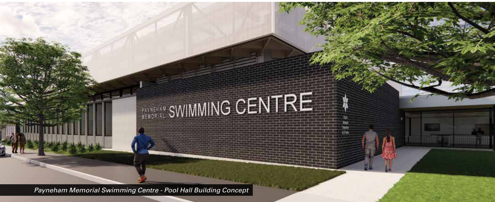
Payneham Memorial Swimming Centre - Pool Hall Building Concept