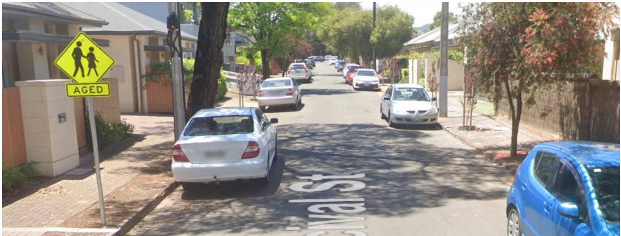
Photo 1: The pedestrian warning signs in Percival Street for eastbound traffic, near Queen Street

The signs in contention are the ' Pedestrian ' warning signs with ' Aged ' supplementary plates, located at each end of Percival Street, as shown in Photos 1 and 2 .