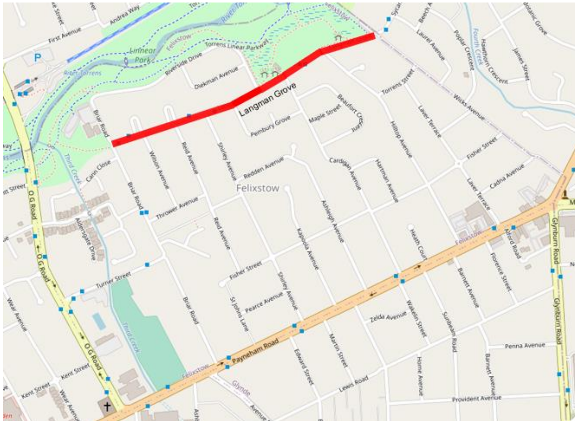
Figure 2: Location of Langman Grove, Felixstow

The location of Langman Grove is depicted in Figure 1 , below.