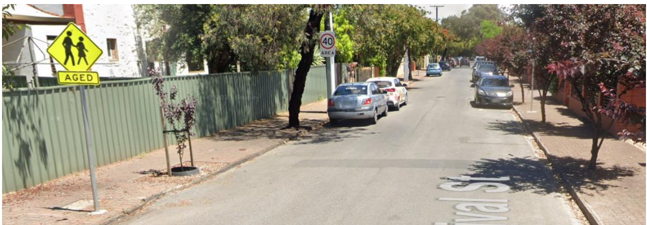
Photo 2: the pedestrian warning signs in Percival Street for westbound traffic, near Portrush Road