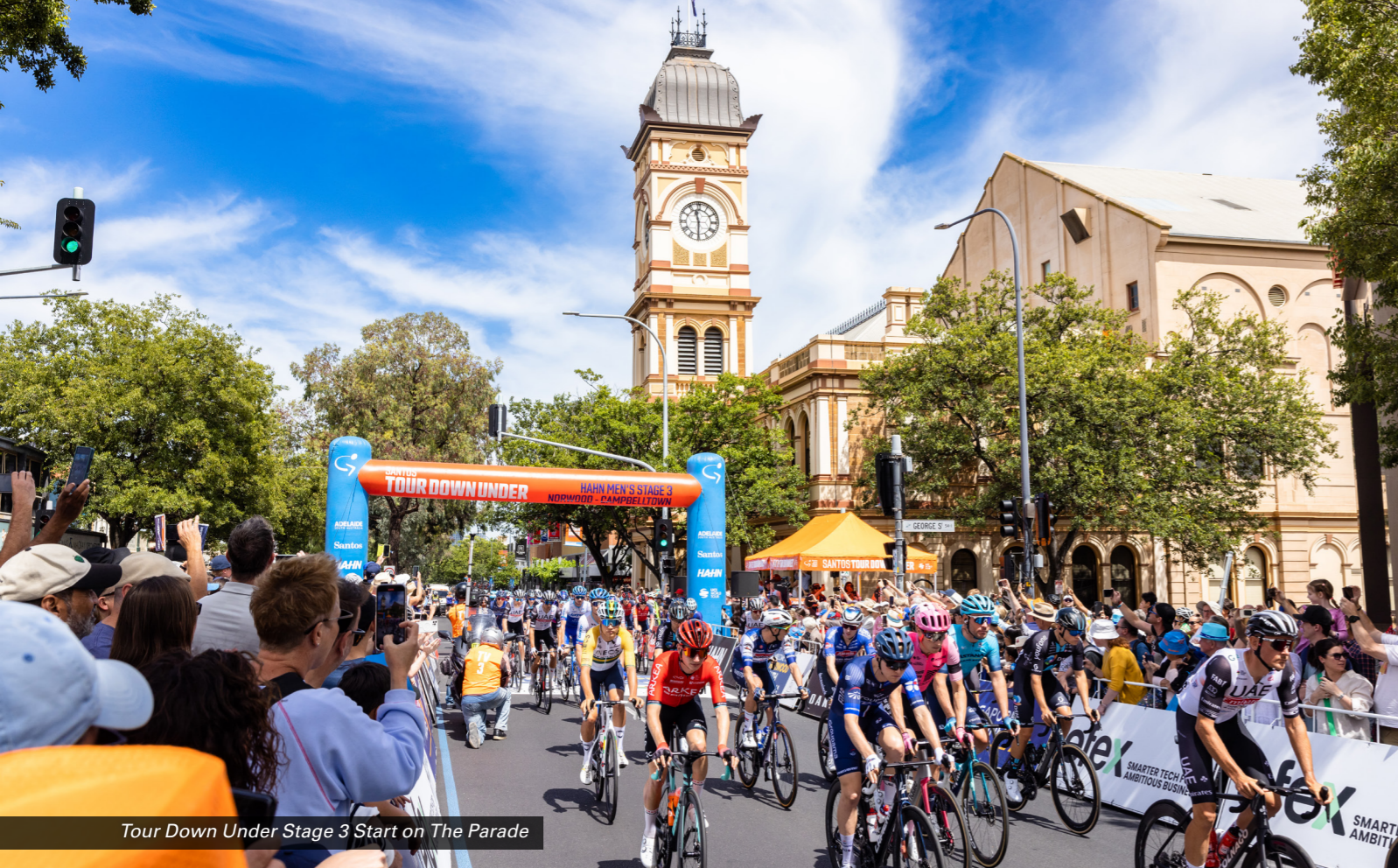
Tour Down Under Stage 3 Start on The Parade