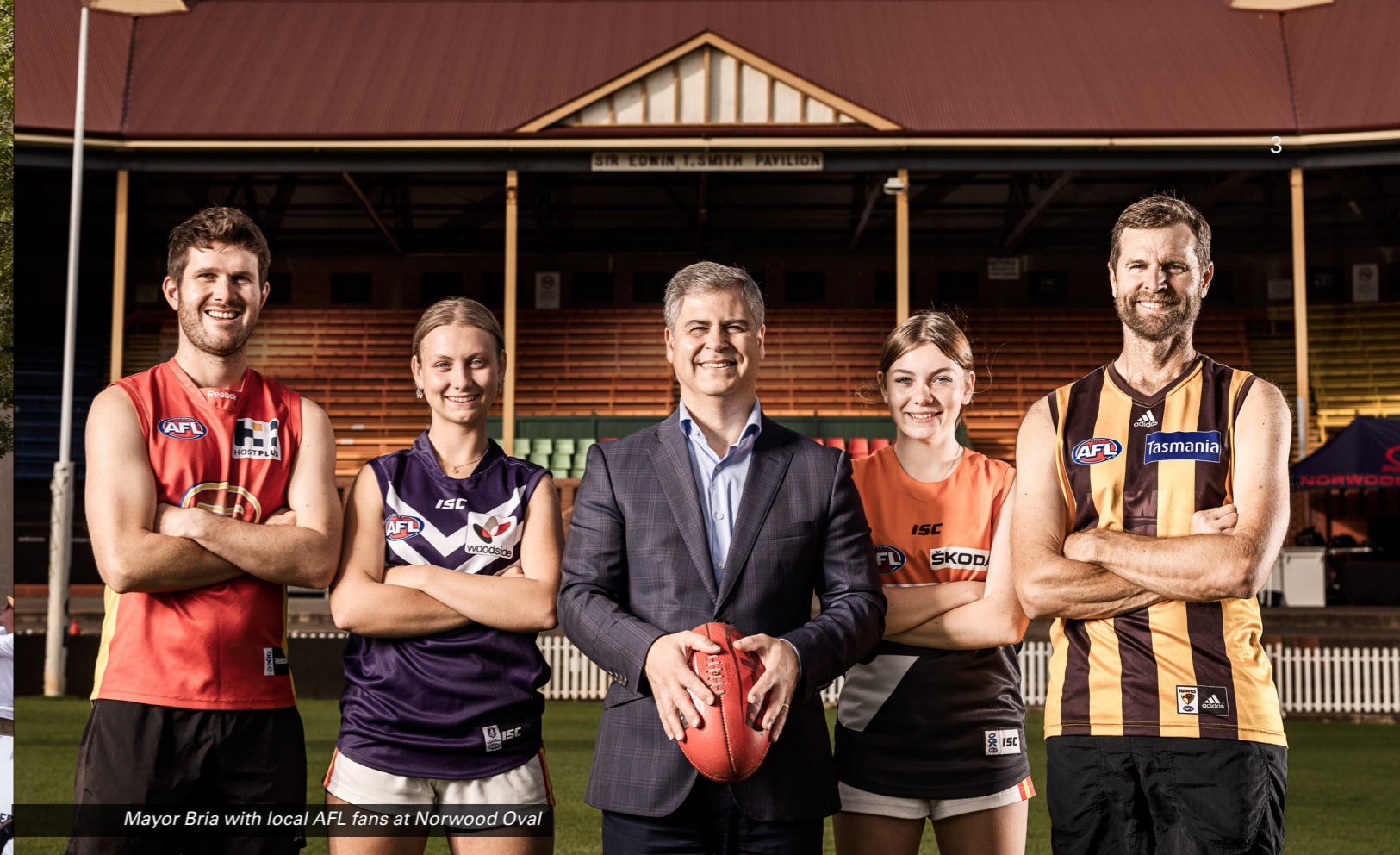
Mayor Bria with local AFL fans at Norwood Oval