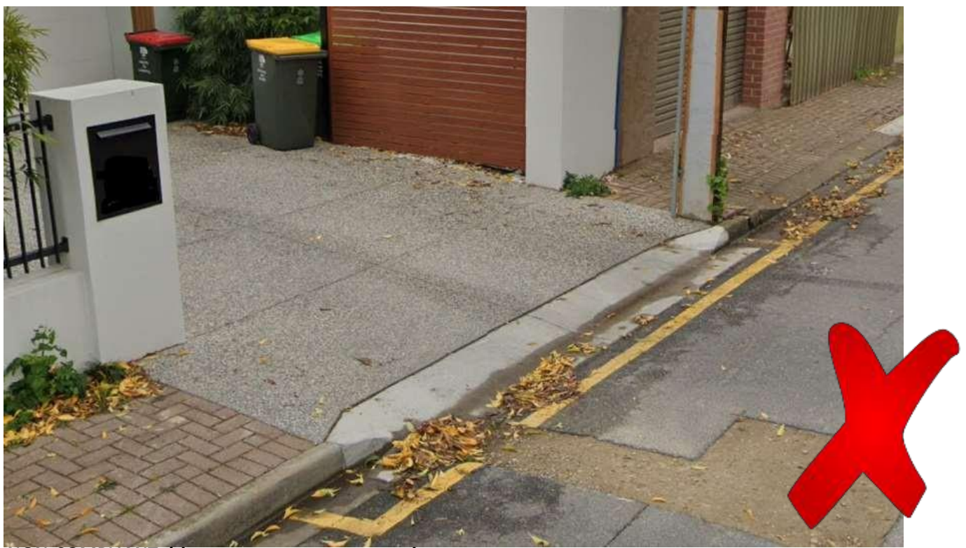
NON-COMPLIANT driveway crossover construction