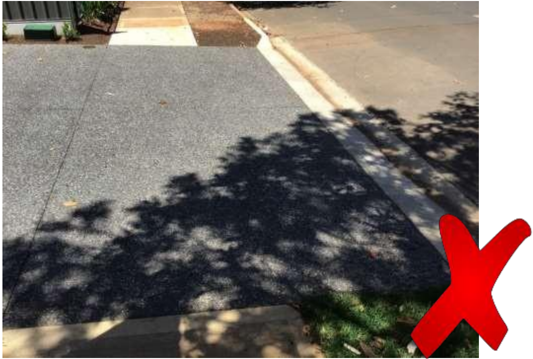
NON-COMPLIANT Driveway Crossover Construction