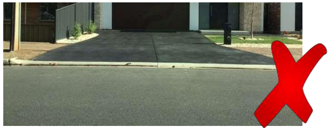
NON-COMPLIANT DRIVEWAY CROSSOVER FINISH

X Driveway crossover has a black epoxy finish which does not match the adjacent footpath finish