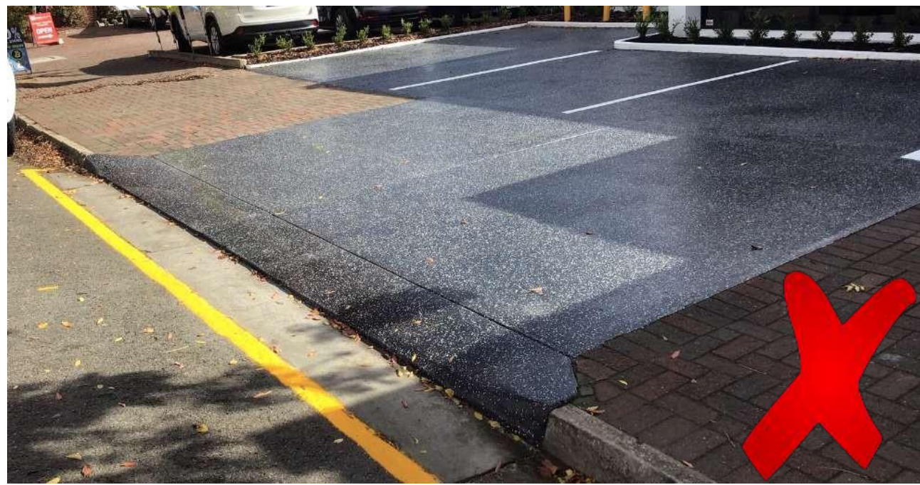
NON-COMPLIANT DRIVEWAY CROSSOVER FINISH

X Driveway crossover has a black epoxy finish which does not match the adjacent footpath finish