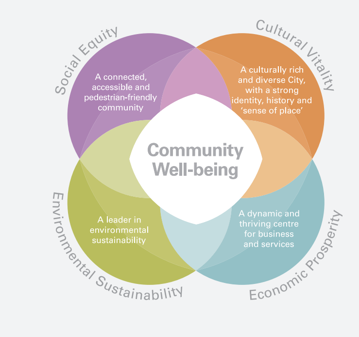
Figure 1: CityPlan 2030

This Strategy outlines four objectives for youth development and engagement. These objectives are informed by consultation with young people and those who support them. They align with the State Government's Strong Futures: SA Youth Action Plan and are integral to achieving the goals of CityPlan 2030: Shaping our Future .